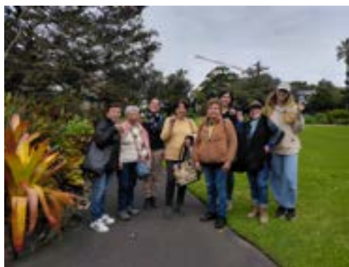
Edogawa Commemorative Garden in Gosford